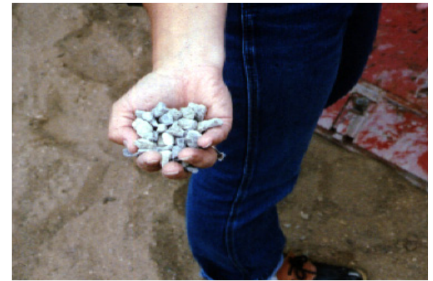
Bentonite material used for well plugging.

Wells must be sealed at or above the ground surface with a welded, threaded, or mechanically attached watertight cap. The Division of Water recommends that the well also be completely filled with impervious grouting material as specified in 312 IAC 13. A well that poses a hazard to human health must be plugged with impervious grouting material.