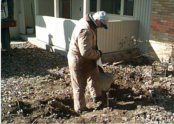
Abandoned water well being plugged by a licensed water well driller.

A water well that has not been used for more than three months, but is not abandoned, must be sealed at or above the land surface with a welded, threaded, or mechanically attached watertight cap.